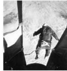
Automatic camera recording of Kittinger as he jumped.

(Adapted from http://www.centennialofflight.gov )