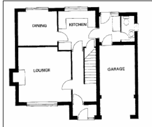
House Plan – Ground Floor Layout